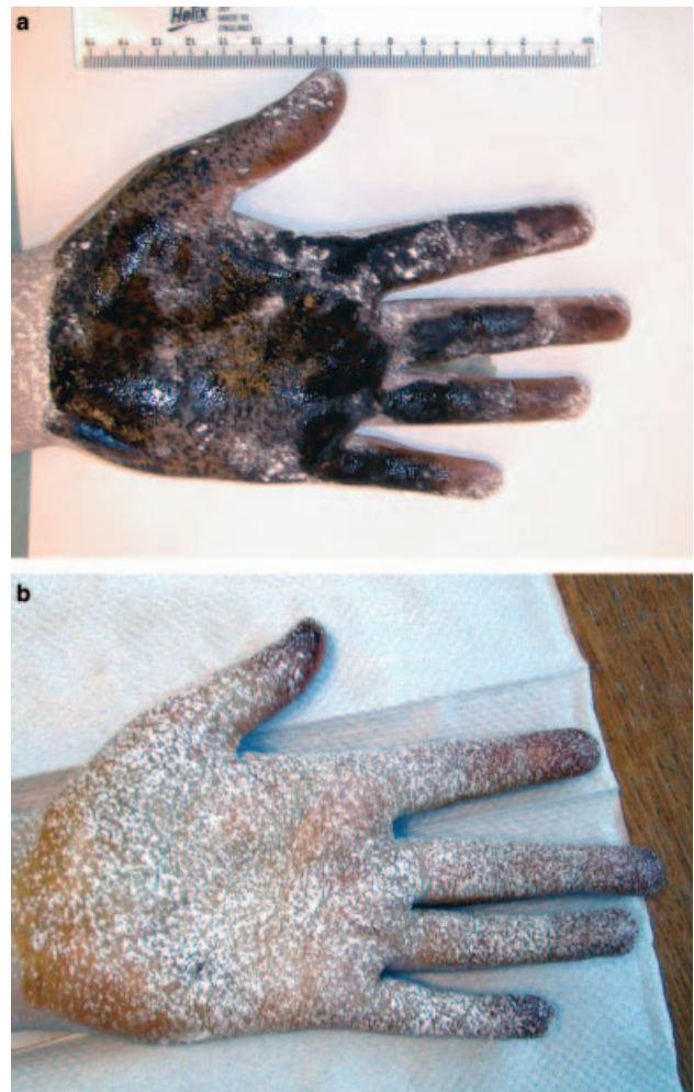
Figure 1. A starch-iodine test is used to delineate the hyperhidrotic area. This shows Patient 1's left palm (a) pre-, and (b) 2 weeks' post-BOTOX ® iontophoresis.

Both patients reported a subjective reduction in sweating of their treated hands of about 70% within 72 h, which correlated well with starch-iodine (Fig. 1) and gravimetry measurements (Fig. 2). Gravimetry at