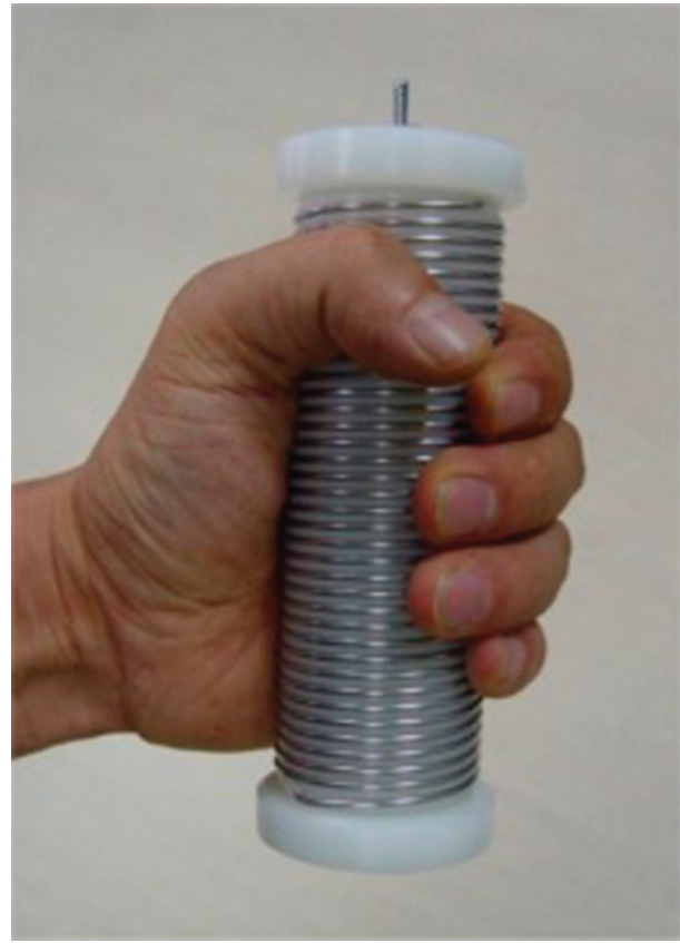
Figure 1. Grasping of the device for palmar hyperhidrosis. The palm near the wrist and volar aspect of the thumb were not contacted with the electric wires; hence these areas were less effective.

from both the treated and the untreated hands, which were examined histologically with hematoxylin-eosin stain and periodic acid-Schiff stain.