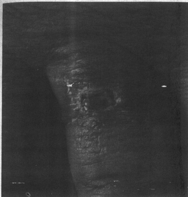
Figure 1. Electrical burn at the site of contact with a metal ring, worn during iontophoresis.

hyperhidrosis, with at least one affected first-degree relative.