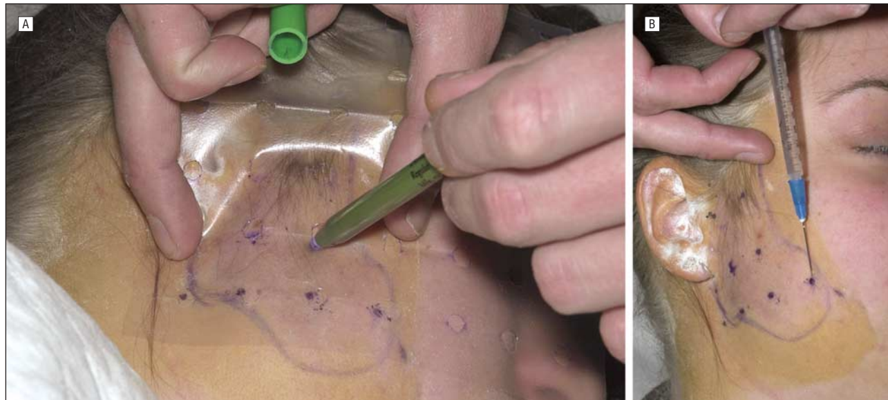
Figure 1. Before each treatment, the affected area, as determined by the starch-iodine test, was marked and divided into 4-cm squares (A); botulinum toxin type A was injected into the middle of each square (B).

by collateral growth. In studies with longer follow-up, the effectiveness of the botulinum treatment was temporary, and recurrence rates were higher. 9,10,14 However, because the severity of recurrent Frey syndrome is reduced when compared with the initial severity and because recurrent Frey syndrome remains amenable to reinjection of botulinum toxin type A, intracutaneous injection is the first-line treatment option. 11,14