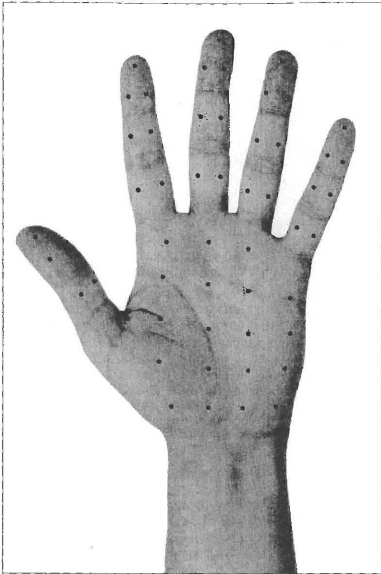
Figure 1. Injection grid for palmar hyperhidrosis.

where the drug may be wasted. A 30-gauge needle is standard, but several experts have reported reduced patient pain with a 31- or 32-gauge needle. 16 If the syringe allows for an interchangeable needle, it is recommended to select a syringe that uses a luer lock connection. A permanently attached needle allows for less waste, but it can become dull after several injections. The choice of syringe and needle depends primarily on the physician's preference. One study evaluated the use of the Dermojet ® to reduce the pain of injection in palmar HH; however, the results indicated that BTX-A administered by conventional injection was more effective than BTX-A administered by Dermojet. 17